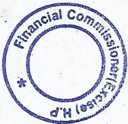
Financial Commissioner (Excise) Himachal Pradesh